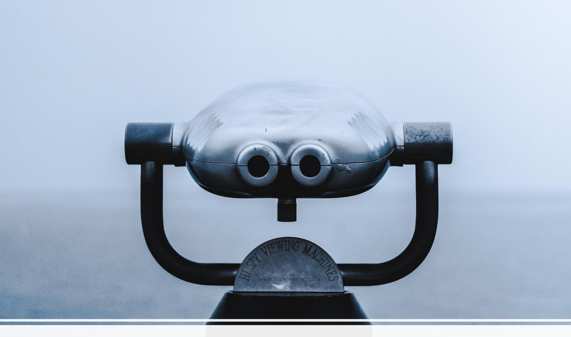
We Are A Church Looking For What God Is Doing