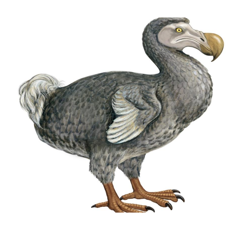
Adapt or die.